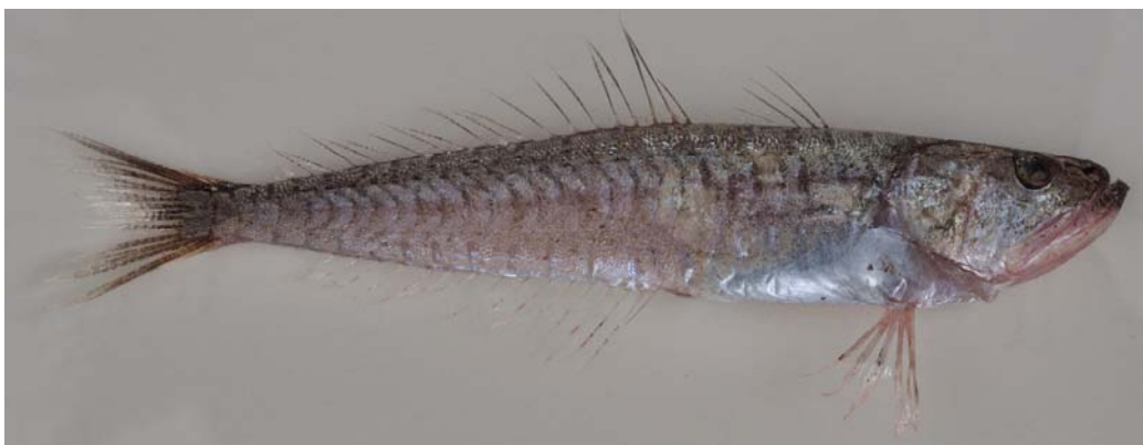
Champsoodon nudivittis (TAU – P. 14329).