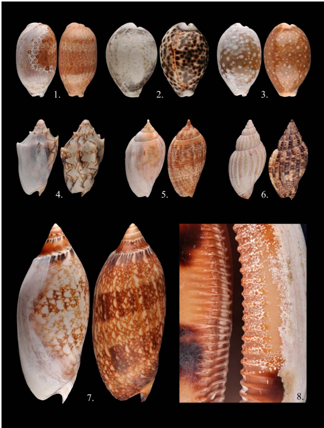
Plate 1: Examples of Byne's "disease" in the Mollusc Collection. Figs. 1-7. At left an affected and right an unaffected specimen. 1. Lyncina argus (Linnaeus, 1758), 2. Cypraea tigris Linnaeus, 1758, 3. Lyncina vitellus (Linnaeus, 1758), 4. Cymbiola vesperilio (Linnaeus, 1758), 5. Harpulina lapponica (Linnaeus, 1767), 6. Lyria mitraeformis (Lamarck, 1811), 7. Amoria damonii Gray, 1864, 8. Close up of the aperture of Lyncina argus (Linnaeus, 1758).